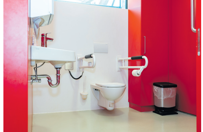
Barrier-free WC on the ground floor