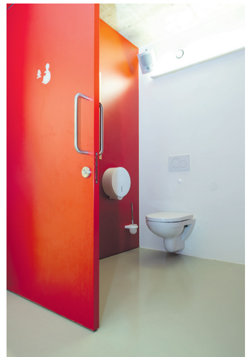
Low-barrier WC in the basement