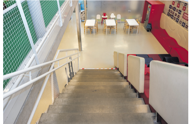
Steps to exhibition in the basement