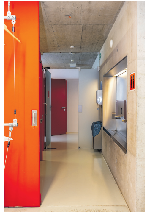
Low-barrier WC in the basement