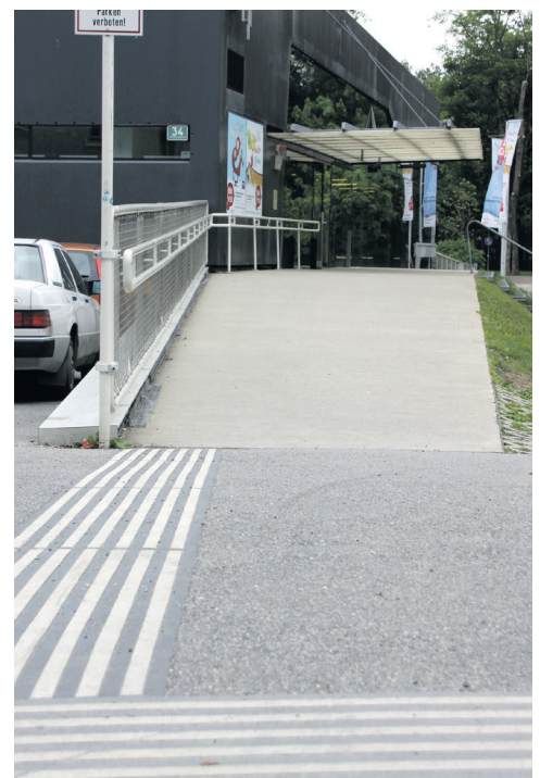
Access with ramp