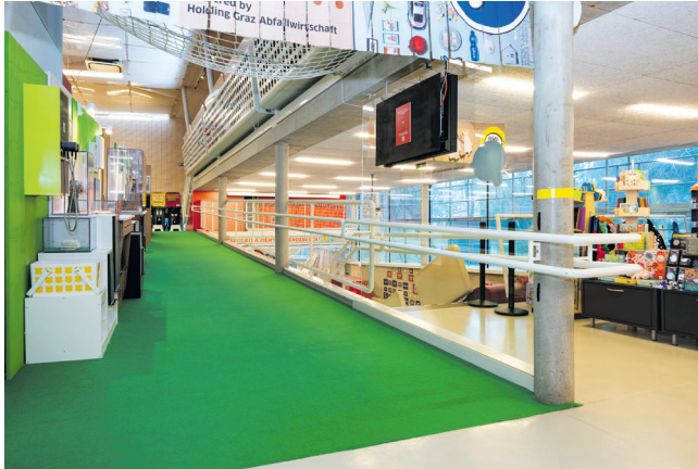
Ramp to exhibition on upper floor