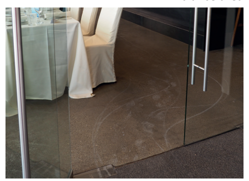
Entrance to restaurant